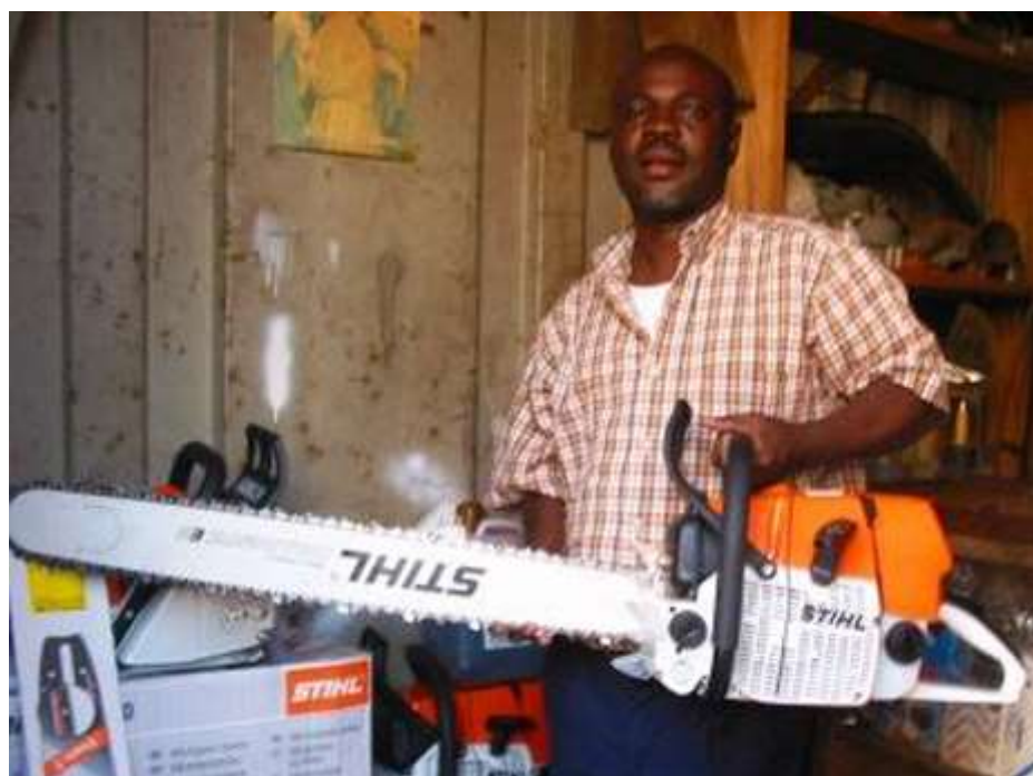
Chainsaw from the President